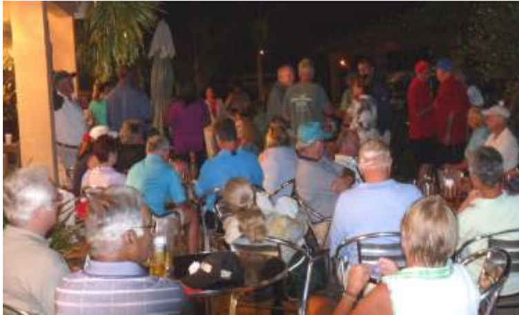
A super size crowd attended the awards dinner—the food and weather were as good as they could be.